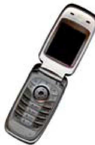
Fig. 2. Example of an unacceptable low-resolution image

Figures must be numbered using Arabic numerals. Figure captions must be in 8 pt Regular font. Captions of a single