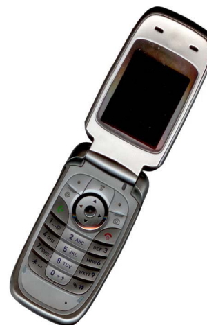
Fig. 3. Example of an image with acceptable resolution

line (e.g. Fig. 2) must be centered whereas multi-line captions must be justified (e.g. Fig. 1). Captions with figure numbers must be placed after their associated figures, as shown in Fig. 1.